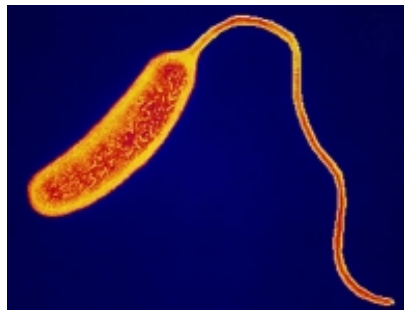
Photo: Vibrio cholerae , the bacterium that causes cholera